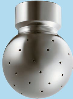
Material: Stainless steel 316L